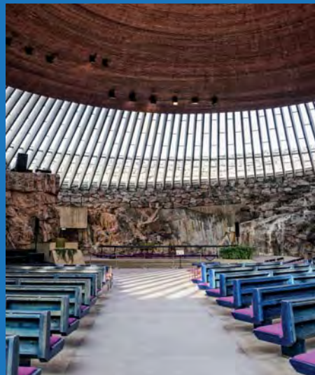
Interior of the Tempeliakio Church, also known as the Church of the Rock or Rock Church.