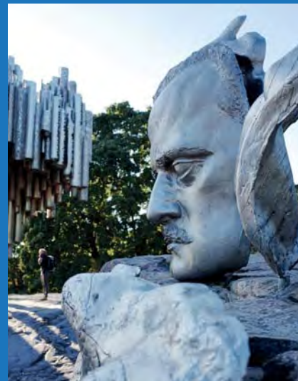
The Sibelius Monument, resembling organ pipes, is made of welded steel with over 600 pipes and with the bust of the composer on one side.