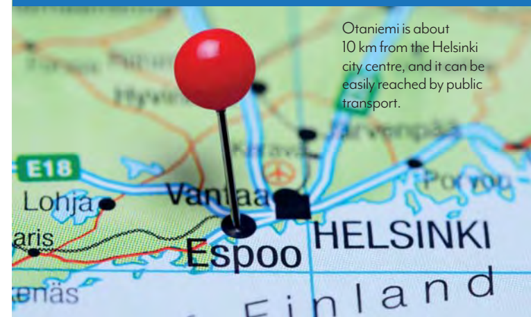
Otaniemi is about 10 km from the Helsinki city centre, and it can be easily reached by public transport.

Please feel free to order our newsletter and we'll let you know about all important information straight in your inbox. roomventilation2018.org